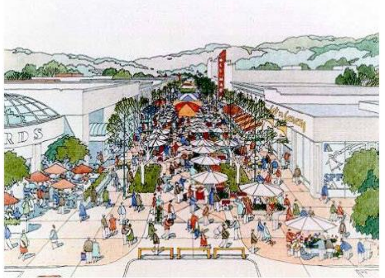
... will be transformed once a weekinto a Farmers Market. can be transformed for special occasions and events.